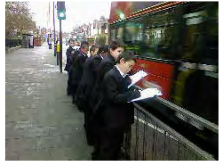
Education for sustainable development

I enjoyed the project because I have learnt a lot and it has been a lot of fun meeting the teachers from the Urban Studies Centre. I have enjoyed helping other people to get out of their cars and start using more desirable forms of transport. It was not an easy thing to do, but I like challenges. Year 5 pupil, Langford Primary