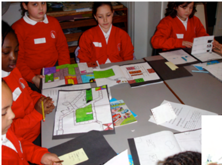
Working with the local council on local priorities