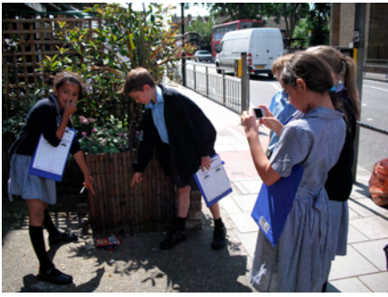
Participating in the life of the class and the organisation of the school

I enjoyed the project because I have learnt a lot and it has been a lot of fun meeting the teachers from the Urban Studies Centre. I have enjoyed helping other people to get out of their cars and start using more desirable forms of transport. It was not an easy thing to do, but I like challenges. Year 5 pupil, Langford Primary